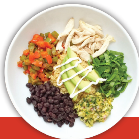
Latin-American Burrito Bowls with Chicken

Find more recipes at www.oldwayspt.org/recipes