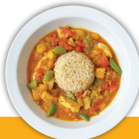
Asian Coconut Fish Curry with Mango and Sugar Snap Peas