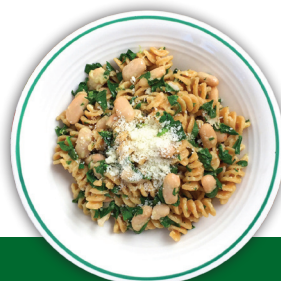
Mediterranean Pasta with Spinach and Beans