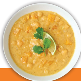
African Heritage Peanut Squash Soup with Chickpeas